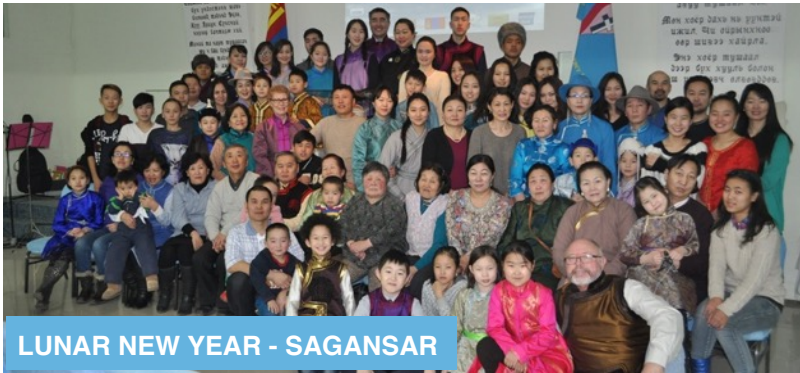
LUNAR NEW YEAR - SAGANSAR