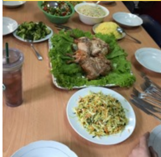
THANKSGIVING LUNCH GIVEN BY NGO STAFF.

many other ways, with no hope of getting better. Our churches truly look forward to coming of our Christ and Savior. Our hope is not in this world, and if you believe the Bible it is not going to get better till we see Christ.