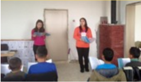
Young ladies from Rich Heart teaching in Uainoor

China's Record." The article reads in part, "the recorded level of particulate matter in Ulaanbaatar's air was 25 times higher than the suggested guidelines of the World Health Organization (WHO), breaking Beijing's record for dangerously high levels of air pollution." Each year the smoke from the coal burning stoves, the