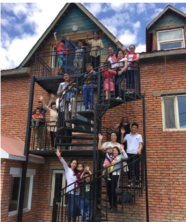
We needed to build a fire escape for the third floor. After it was finished we tested it for strength.

We have finally made it into our new sanctuary. On the last Saturday in June all of our churches were invited to come and help us dedicate our building to God. We were very pleasantly surprised at how well our building held 80 plus people. Each of our five churches were represented. They, along with others brought gifts for our new building. Men and pastors from each church were given time to encourage the new church in Yarmag to contend for the faith and be a lighthouse to all those living around them.